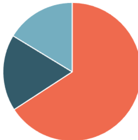
Managers by Region