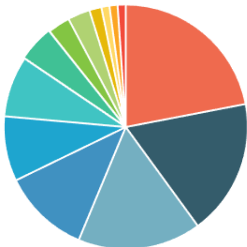
Allocators by Type