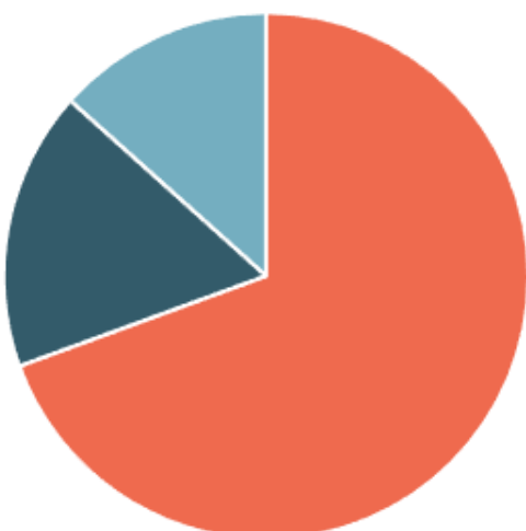
Allocators by Region