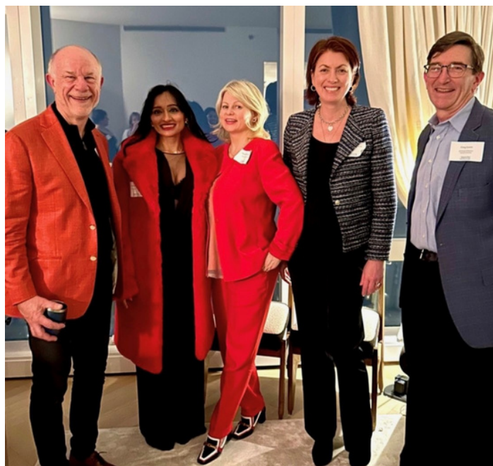
Joyce Ivy Foundation Event New York