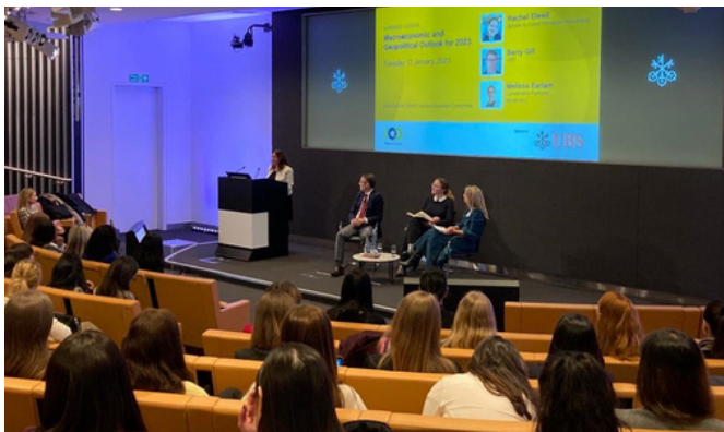
Macroeconomic and Geopolitical Outlook for 2023 London