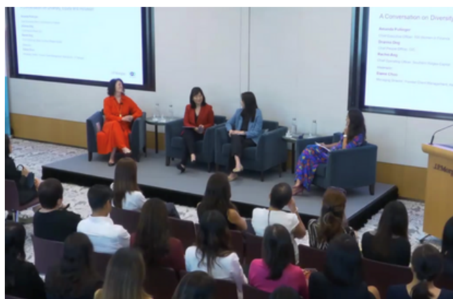
Conversations on DEI hosted by J.P. Morgan Singapore