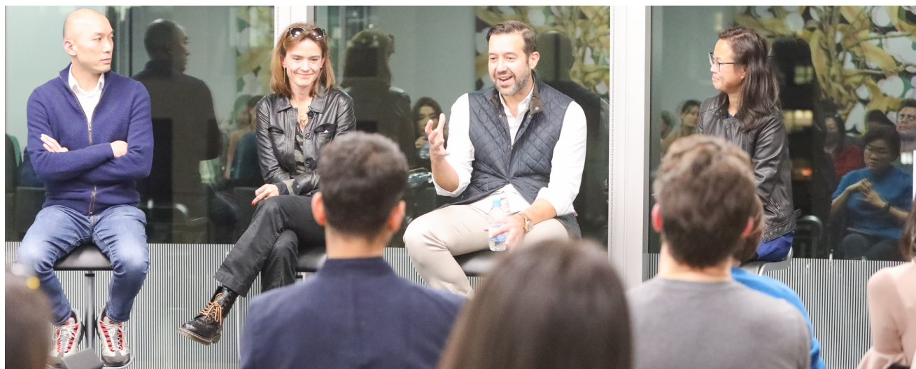
100WFinTech Event Hong Kong