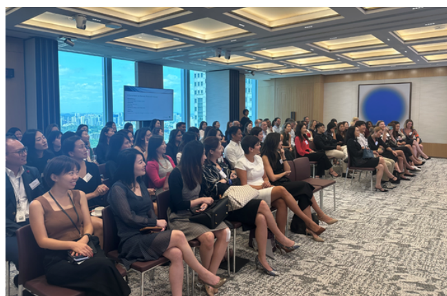
Conversations on DEI hosted by J.P. Morgan Singapore