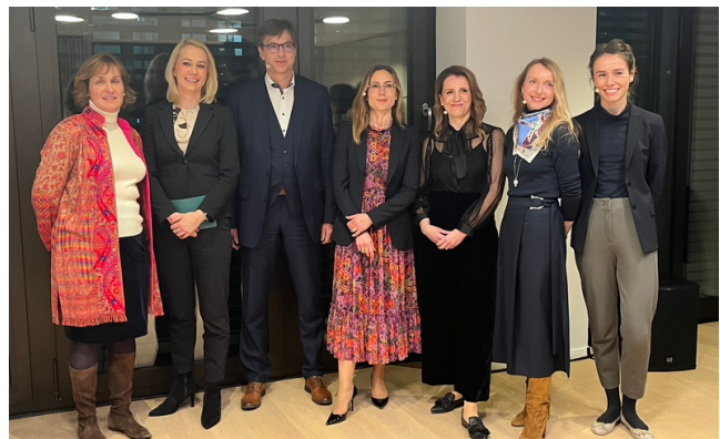
Capital Markets and the Road Ahead Germany