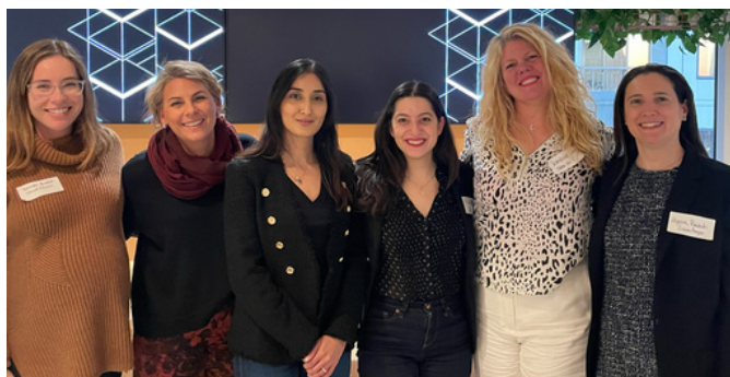
VC Fundraising and Compensation Panel Northern California