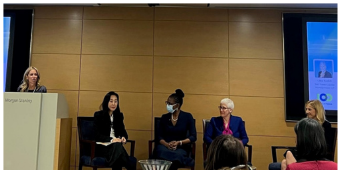
Senior Portfolio Manager Panel hosted by Morgan Stanley New York