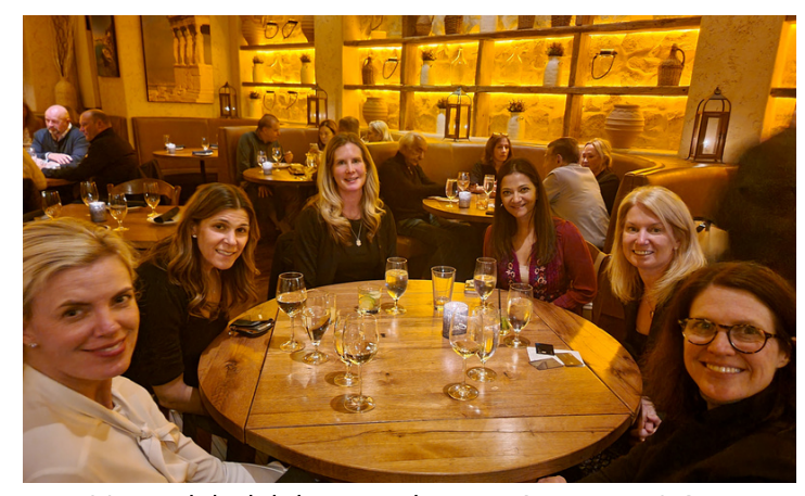
100WF Philadelphia members at Giuseppe & Sons

On March 6, the Philadelphia committee organized casual cocktails and dinner at two separate venues, Estia Taverna Radnor and Giuseppe & Sons. 100WF members were encouraged to bring a guest from the financial industry as the evening was an opportunity for members to reconnect with colleagues and expand their professional network.