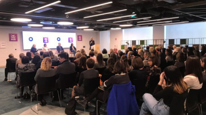
How ESG is Integrated into Business as Usual in 2023 and Beyond