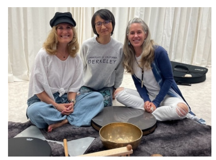
North California Education Committee Event: "Soul-Soothing Breathwork and Sound Healing"