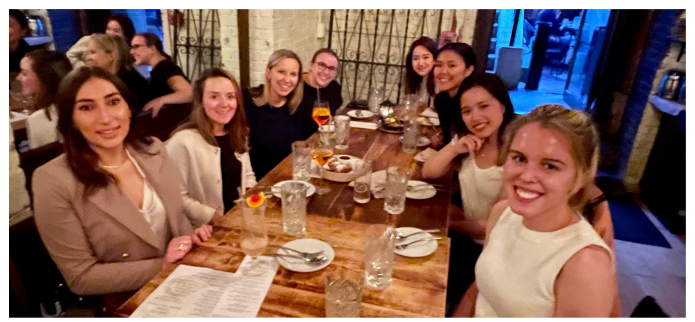
Early Career Boston Dinner Series at Buttermilk & Bourbon

The much-awaited Dinner Series, organized by the Boston Early Career Committee, commenced on June 15 at Buttermilk & Bourbon. With gracious sponsorship from MFS Investment Management, this inaugural dinner provided an intimate setting for fostering connections.