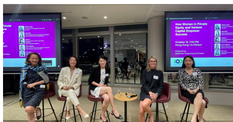
How Women in Private Equity and Venture Capital Empower Success