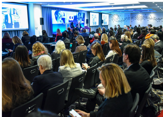
Global FundWomen Week New York City