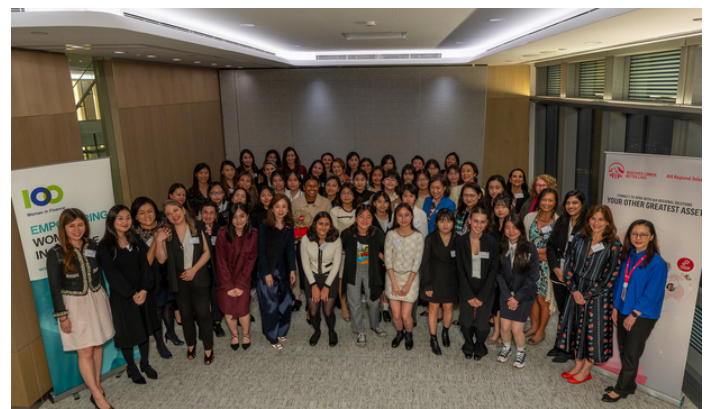
First Impressions Dinner Hong Kong