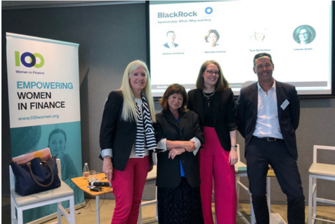
Sponsorship: What, Why and How Sydney