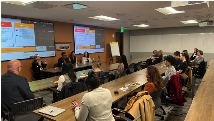
CFO Perspectives: Managing in an Uncertain Environment Washington, D.C.