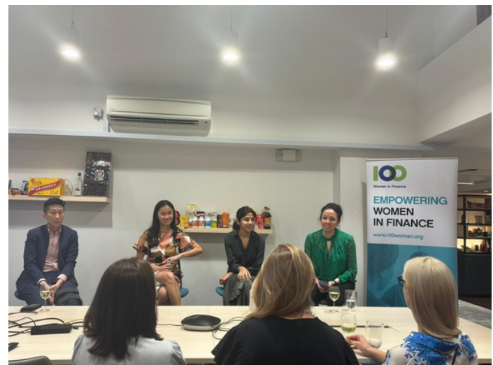
Learn How Philanthropy and Volunteerism Support Marginalised Girls and Young Women in Asia Singapore