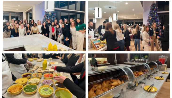
Holiday Party and Indian Cooking Demo Salt Lake City