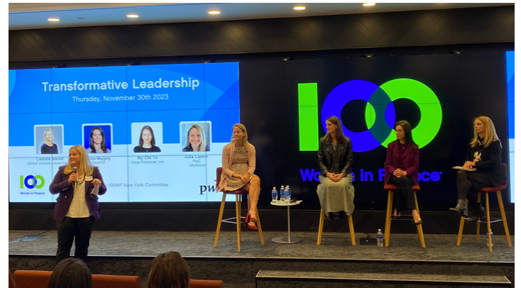
Transformative Leadership New York

On November 30, the Chicago committee organized an educational wine-tasting and networking event in celebration of the holidays. Members learned to discern the features of six international wines produced by women winemakers and consider if the price is truly indicative of quality in this unique market. The event was hosted by EY.