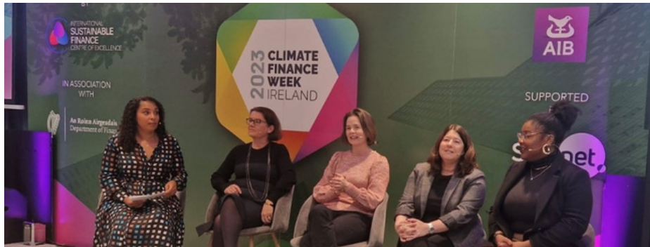
The Rise of Female Entrepreneurs in Sustainability Dublin

On December 13, the Cayman Island committee organized a fundraising event, Bubbles & Bling, for the benefit of the 100 Women in Finance Foundation (Foundation). The event was hosted by Island Jewellers. Attendees had the opportunity to view the latest jewelry collections in time for the holiday season. A portion of the evening's sales were donated to the Foundation. Members and their guests enjoyed bubbly while networking, and reflecting on the past year's events and how they supported the mission and progressed Vision 30/40.