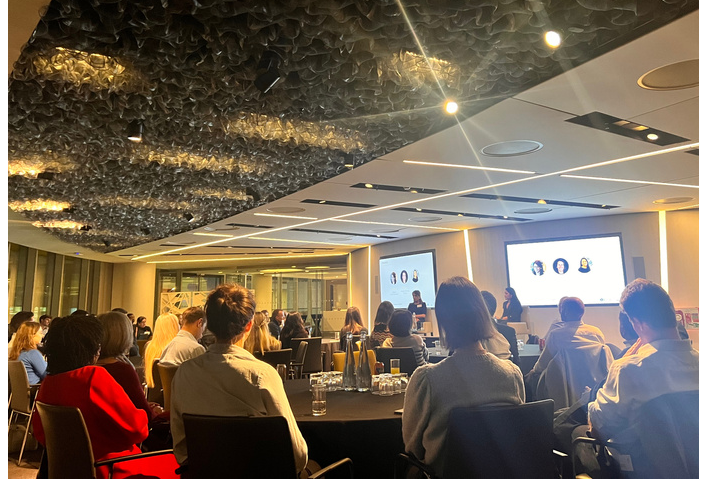
Scaling Fintech Globally: Navigating Challenges and Seizing Opportunities London