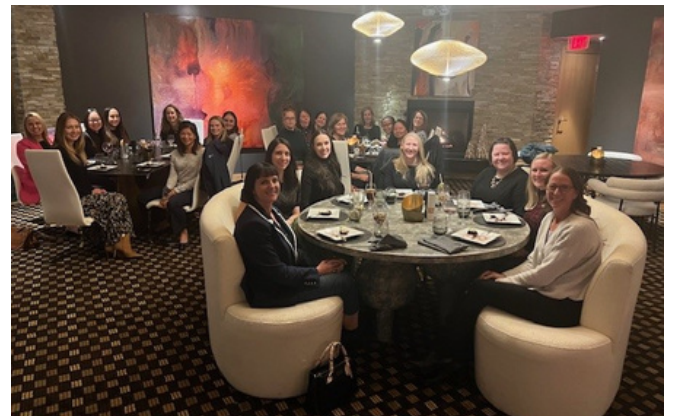
Senior Practitioner (Salt Lake City) November 20 hosted by: Goldman Sachs