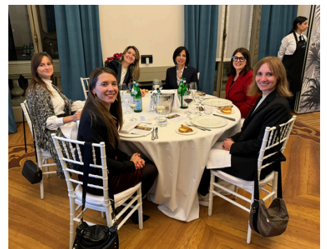
Senior Practitioner (Milan) November 19 hosted by: Wellington Management & WExecutive