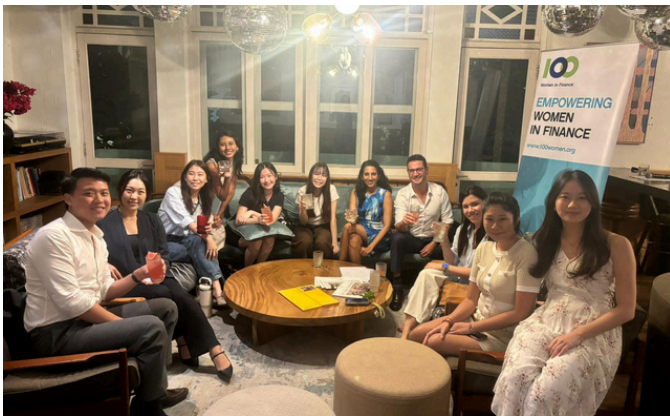
Early Career (Singapore) November 13

As the year came to a close, many 100WF committees gathered for sessions dedicated to planning and strategizing for 2025, while also reviewing the past year's events to build on successes and identify ways to enhance future initiatives. Senior practitioner dinners were held in Salt Lake City and Milan, and the Milan dinner included past event speakers to strengthen their connection with the organization and foster meaningful engagement.